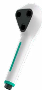
White ref. GS3104V02R