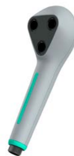
Cool Grey ref. GS3103V02R