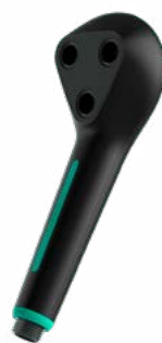
Black ref. GS3100V02R

The handshower can be plugged by hand to any standard GSP 1/2 inch shower hose without any tools.